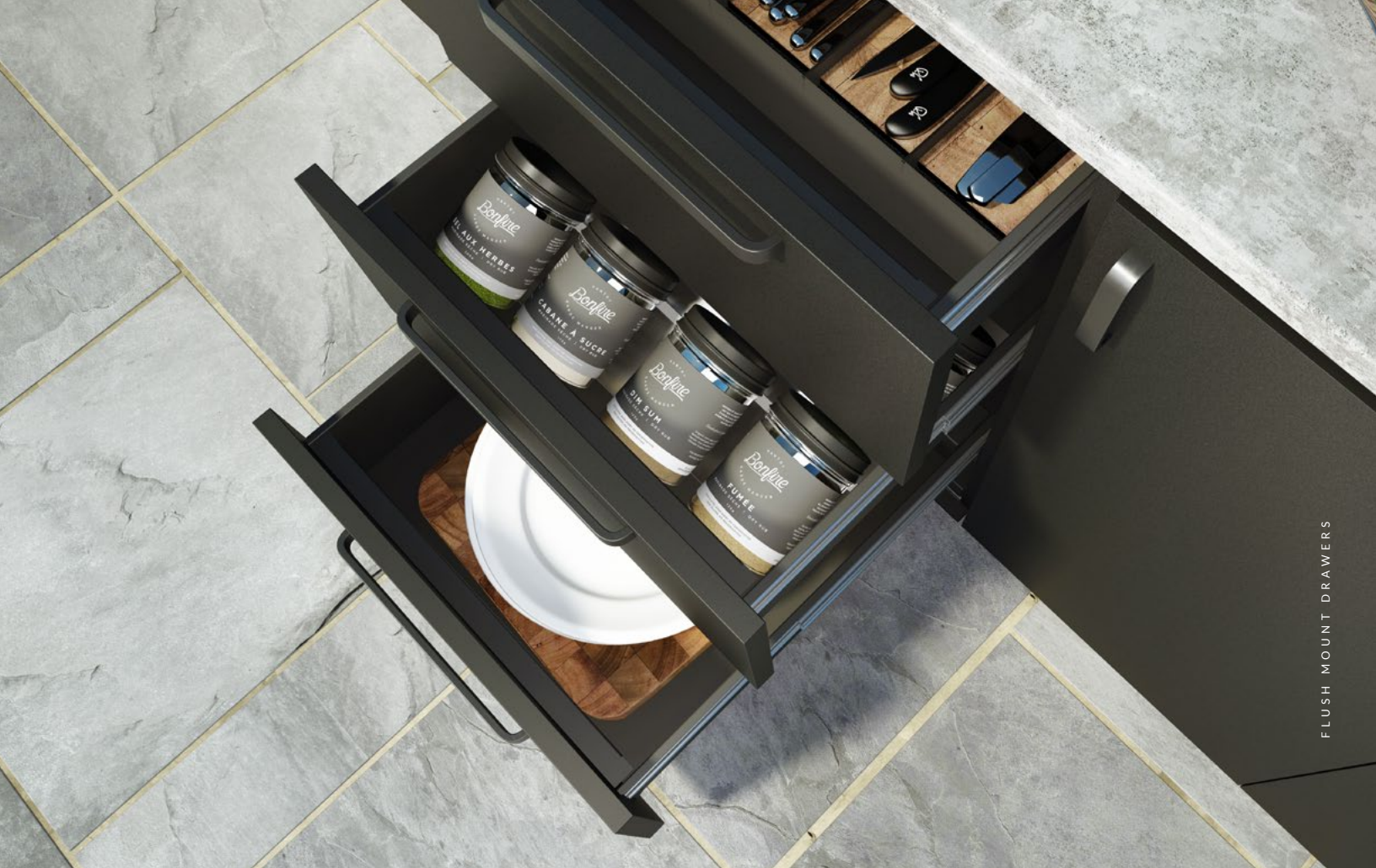
FLUSH MOUNT DRAWERS