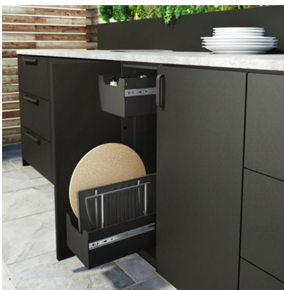
KAMADO ACCESSORY RACK