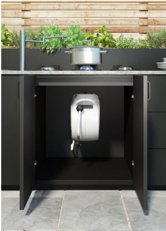
RETRACTABLE GARDEN HOSE

Designed to maximize both the space and functionality of each cabinet, our universal track system integrates seamlessly with fixed shelves, Kamado accessory racks, pull-out drawers, a retractable garden hose and a garbage/recycling system.