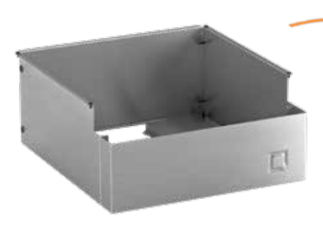
Built-in Socket FOR EXTRA PROTECTION WHEN BUILDING IN A FLAME OR GLOW